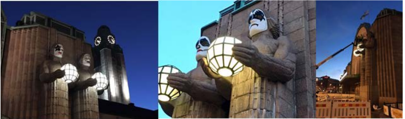
KISS TAKING OVER HELSINKI TRAIN STATION!

On May 4th, the Gods of Rock played their 10th show in Finland's capital. In celebration, the iconic Stonemen that stand guard outside Helsinki's main railway station have been KISSED to honour the band!